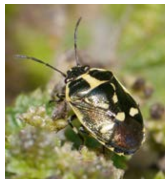
Eurydema oleracea at Amwell Nature Reserve.