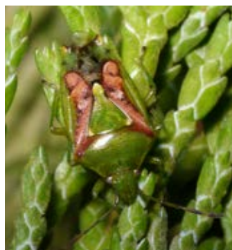
Cyphostethus tristriatus at Mardley Heath.