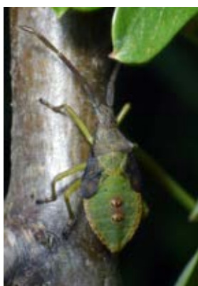
Gonocerus acuteangulatus.

(TL23). The fact that such a conspicuous insect has proven elusive outdoors suggests that either its population in Hertfordshire is small or that it feeds high up in the canopy.