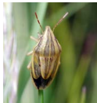
Aelia acuminata at Heartwood Forest.