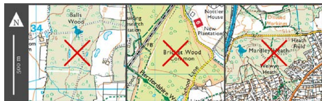
Figure 1. Transect locations for the three study sites (Balls Wood, left; Bricket Wood Common, middle; Mardley Heath, right). The grid references (British National Grid) of the central point of the transects for each woodland were TL3435010310, TL1318001180, and TL2466018195, respectively.

Leaf litter was sampled in one arc of approximately 120° on the northern side and one on the southern side of each tree, with sampling taking place within 0.5 metres of the trunk (Figure 2). Each side was sampled for 4 minutes (measured by a timer), with the order determined by coin flip. Leaves were manually searched at a steady pace, clump by clump working from the middle of the sampling zone towards the