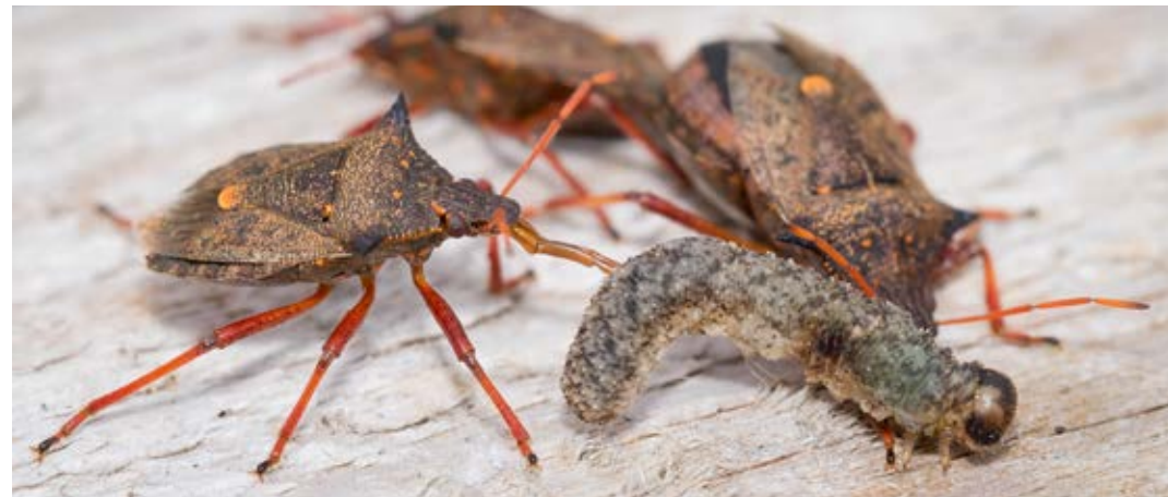
Picromerus bidens at Panshanger Park.