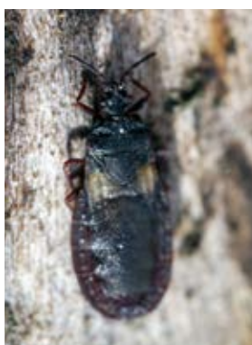
Aneurus avenius (photo Joe Gray).

Leptoglossus occidentalis . As compared with a dozen records from 2014, there was a solitary record in 2015 of the Western Conifer Seedbug (16-20mm), a species which was new to Britain in 2007 (Malumphy et al. , 2008). The 2015 record, from 10 January, was an insect overwintering in a house in Letchworth