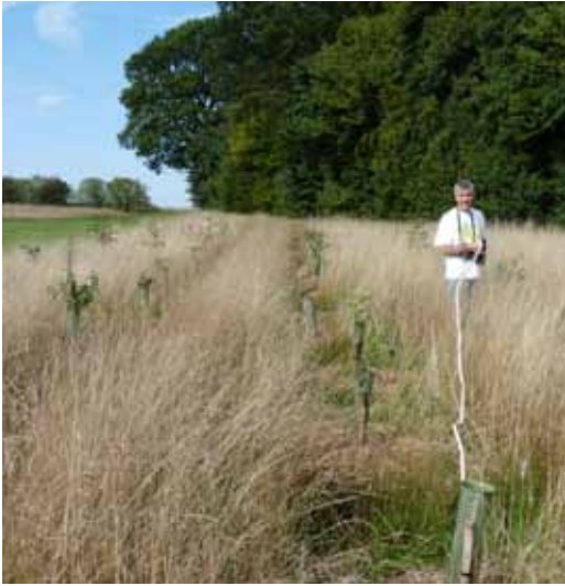
Monitoring the first phase of tree planting at Heartwood Forest.

Volunteers from the Society are working with the Woodland Trust to monitor the survival of the recently planted 200,000 saplings to form the new woodland at Sandridge and the resulting changes in wildlife, including plants, butterflies and birds.